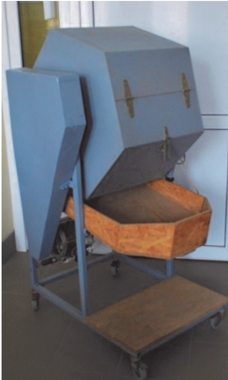
Photo 1. A hexagonal drum used to simulate the formation of blackspots

The BI ranges from 0 (resistant to blackspot bruising) to 100 (the most susceptible to bruising).